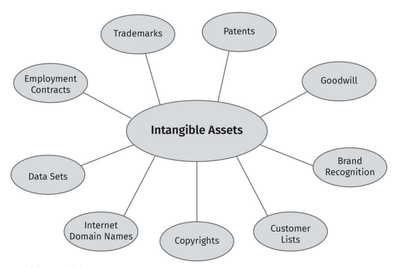
Fig. 1. Representative types of intangible assets.

With a cost approach, datasets are valued based on the estimated historical costs to create the dataset (29) or the anticipated costs incurred to replace the dataset (30). This approach is aligned with the HIPAA requirement to limit data sales for research to cost-based fees to cover the cost of preparing health information (45 CFR 164.502(a)(5)(3)(ii)). When using historical cost as the basis, organizations should consider likely inflation and other infrastructure costs necessary for replacing the dataset (31). Organizations may benefit